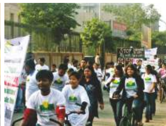
Human Rights Day