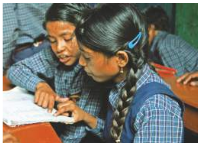
A class in progress

The project that is implemented in Guna district of Madhya Pradesh, is an integrated education and health project and covers five villages. The project ensures education of underprivileged children particularly school drop-outs and non school-going in the