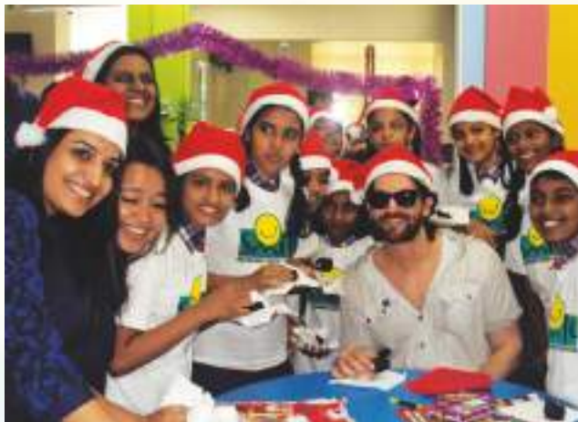
Neil Nitin Mukesh celebrates a special Christmas