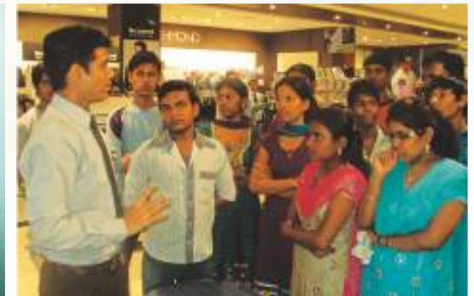
Exposure visit for students at Westside, Mumbai

One of the biggest challenges that India faces even today after the country has made significant progress, is employment generation. While it is challenge for all young people seeking jobs, it is certainly more difficult for the youth coming from the marginalised sections. Most boys and girls from the economically weaker sections of the society manage to study up to the higher secondary level; some of them above average if not brilliant. However despite being good in studies and having a strong desire to study further, they get restrained primarily due to the family's economic conditions. Pressed with economic necessities, some or all usually take up menial unprofessional and non-progressive jobs on daily wages. But this invariably has a negative effect on their moral and mental states; moreover Education loses its importance and value in the perceptions of these young boys and girls, who would be the future of the country.