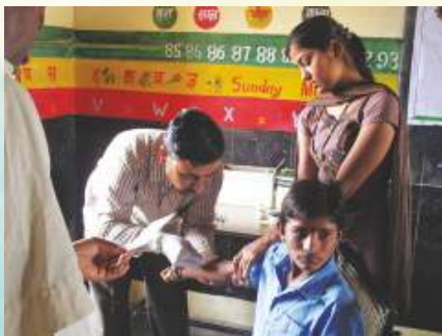
Yellow Fever vaccination at a school health camp in Barmer, Rajasthan