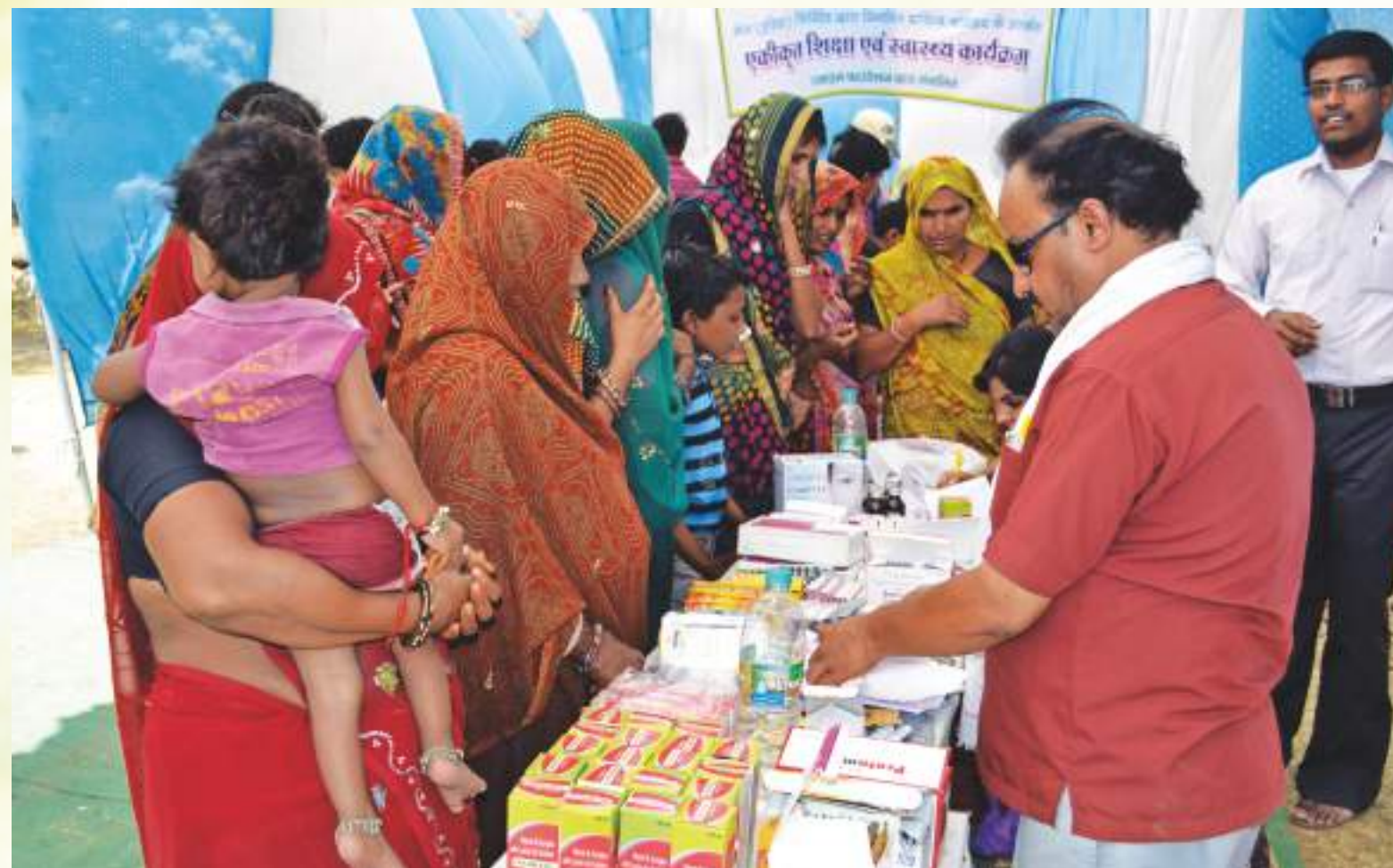
Medicine distribution at a health camp in Guna

benefitted. Women beneficiaries accounted for 42% of the total number, followed by men accounting for 33.1% and children for the remaining 24.9% of the total number. During this period, a total population of 10,73,250 was covered by 12 projects operational in 172 villages/slums of 9 states.