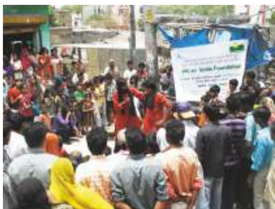
A street play in progress in the community

Also during the year, 40 girls were given full scholarship providing them the needed educational support. More than 200 Change Agents were identified from the target communities and trained. They were all given training in basic self-defence techniques, miming, and puppetry and theatre arts, for various advocacy initiatives. Under an innovative initiative in association with Procter and Gamble, capacity building of 400,000 women and adolescent girls in rural Rajasthan was done through ASHA workers, ensuring menstrual health and hygiene. 1900 privileged youth from prestigious educational institutes across the country were also sensitized during the year.