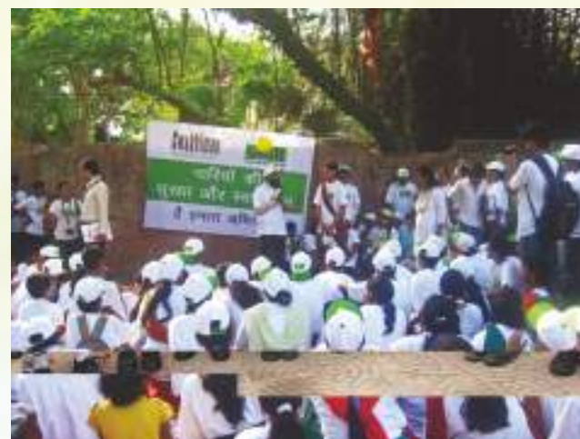
Campaign for women and their safety