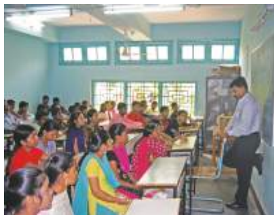
Career Counseling session in Jamshedpur, Jharkhand

The programme now has allied with 100 corporates who employ the students who have completed their training. This year there has been a 69% placement success. Steel Authority of India Limited, Cafe Coffee Day, Pantaloon, Edutech, Aegis, Capgemini, IBM, Coca Cola, Reliance, Eureka Forbes, Apollo Pharmacy, FedEx, Westside, India Bulls, Tata Docomo, Vodafone, Standard Chartered, GE Pvt. Ltd., Flipkart.com, Viva Mobiles and Hero Motor Corporation are some of the prominent employers of the year.