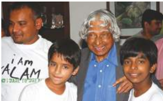
Dr. Kalam with I am Kalam's cast