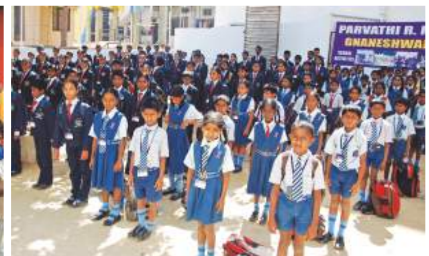
Children getting ready for morning prayers in a Bangalore Mission Education centre