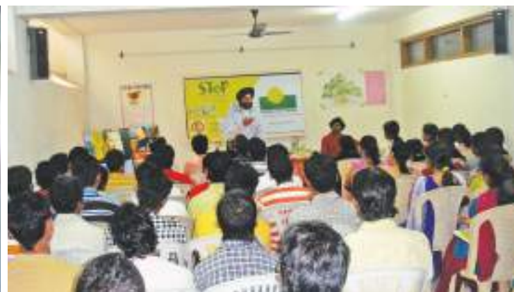
An employee engagement session in Chandigarh