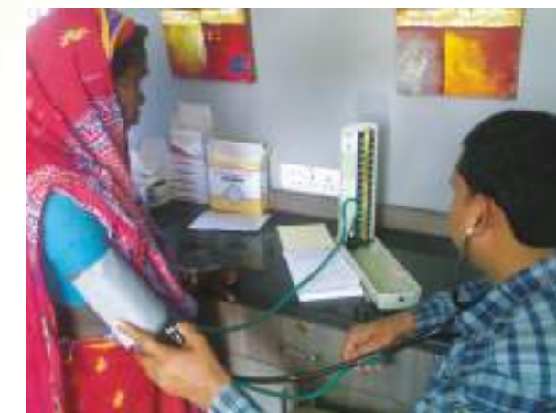
A women gets her BP checked at Madhepura, Bihar