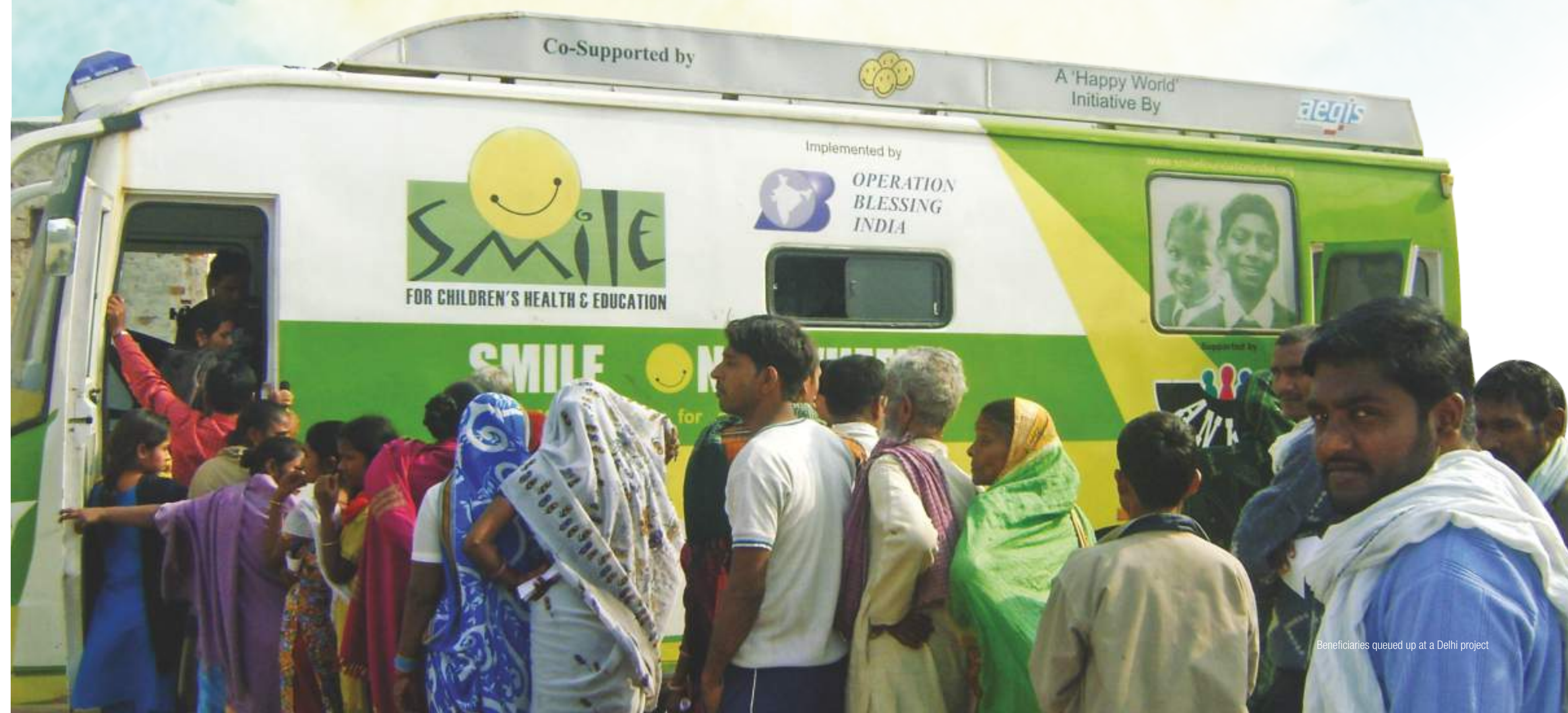
Beneficiaries queued up at a Delhi project

During the year 2011-12, through the partnership model with community based organisations, 1,16,214 people were directly