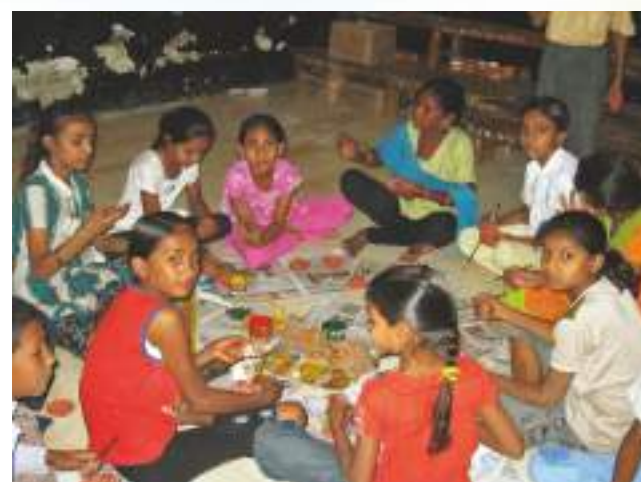
Art and craft workshop at Samvedna Mission Education centre

communications and sustainability perspective. Since one of the core focus areas of AFC is training of professionals engaged in facilitating local civil society groups in fundraising and advocacy for Civic Actions for children, as many as six such training programmes were designed and organised, leading to great results.