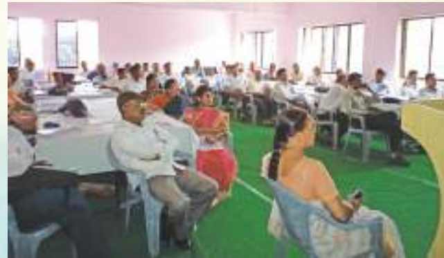
A Principals Meet in Mumbai