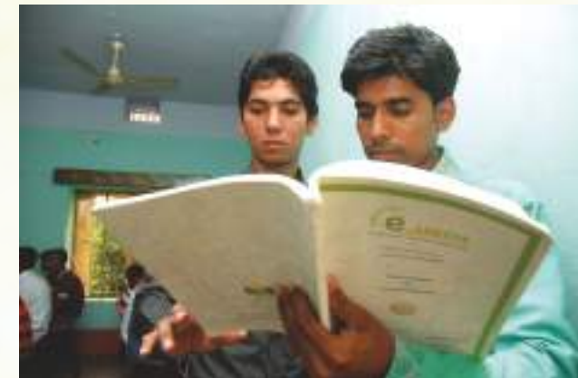
Students go through their curriculum in Ahmedabad