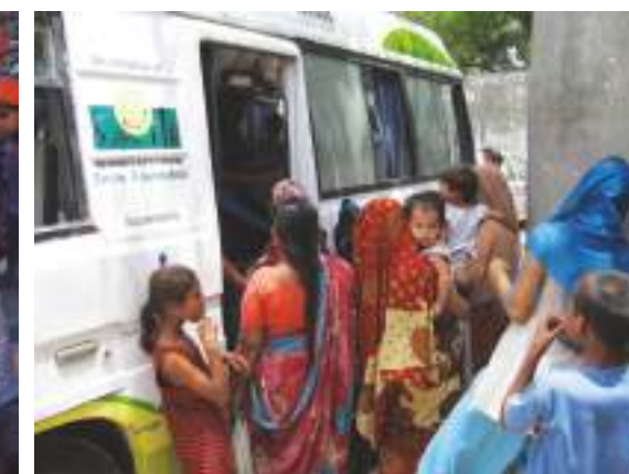
Women await their turn to meet the doctor in the mobile clinic