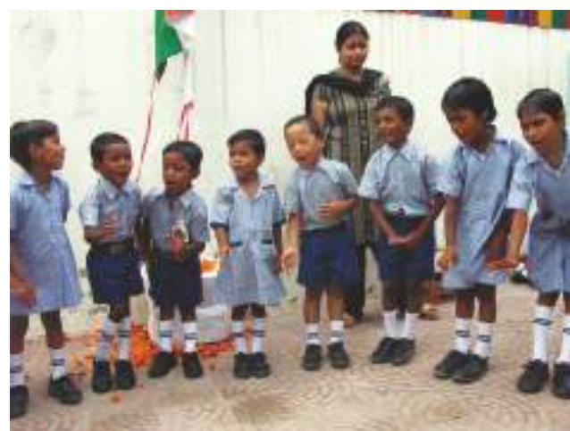
Independence Day celebration at Nai Disha, Mission Education centre, Noida