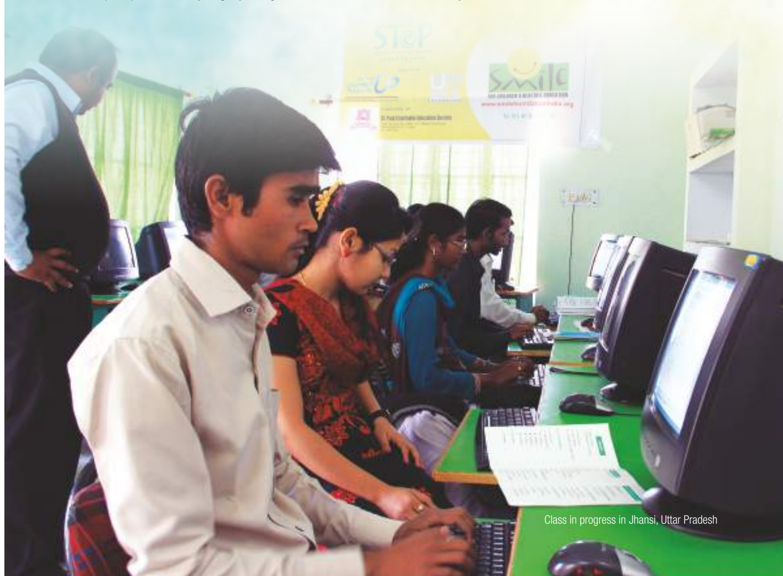
Class in progress in Jhansi, Uttar Pradesh

One of the biggest challenges that India faces even today after the country has made significant progress, is employment generation. While it is challenge for all young people seeking jobs, it is certainly more difficult for the youth coming from the marginalised sections. Most boys and girls from the economically weaker sections of the society manage to study up to the higher secondary level; some of them above average if not brilliant. However despite being good in studies and having a strong desire to study further, they get restrained primarily due to the family's economic conditions. Pressed with economic necessities, some or all usually take up menial unprofessional and non-progressive jobs on daily wages. But this invariably has a negative effect on their moral and mental states; moreover Education loses its importance and value in the perceptions of these young boys and girls, who would be the future of the country.