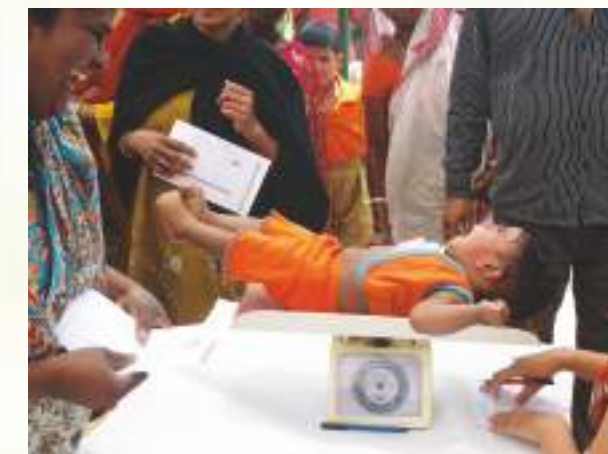
A child gets weighed at smile health camp in Ranchi, Jharkhand