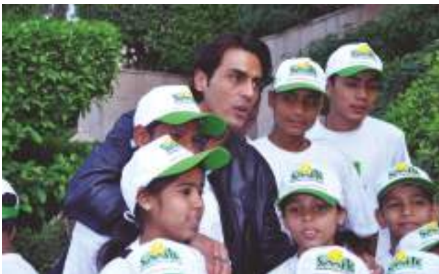
Arjun Rampal shares some smiling moments