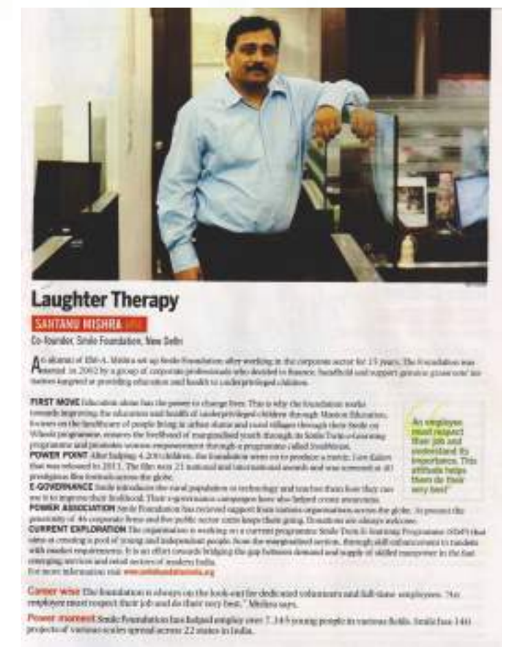
India Today Aspire

This year Smile Foundation was felicitated by the NTR memorial Trust for its Outstanding Achievement and High Standards of Excellence in Educating Underprivileged Children and Youth. Along with Smile eleven other organisations were also nominated for this award.