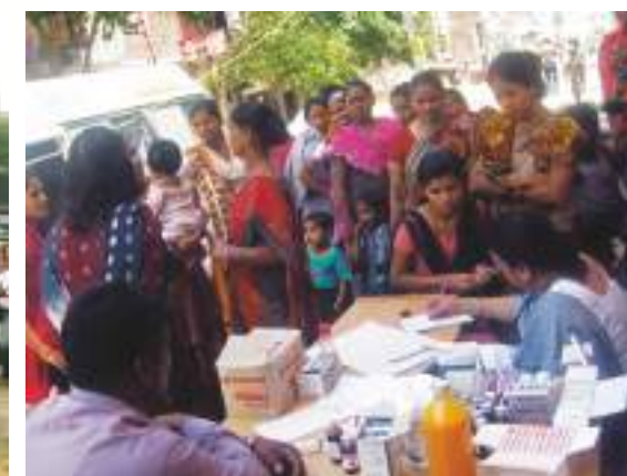
Medicines and contraceptive distribution in the community