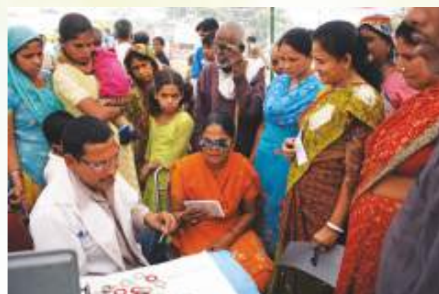
Special eye check up camp in Delhi