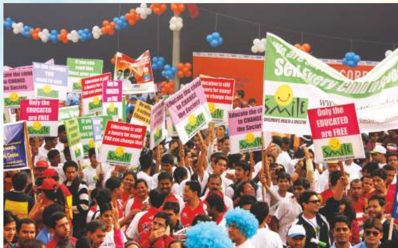
Smile group at the Airtel Delhi Half Marathon