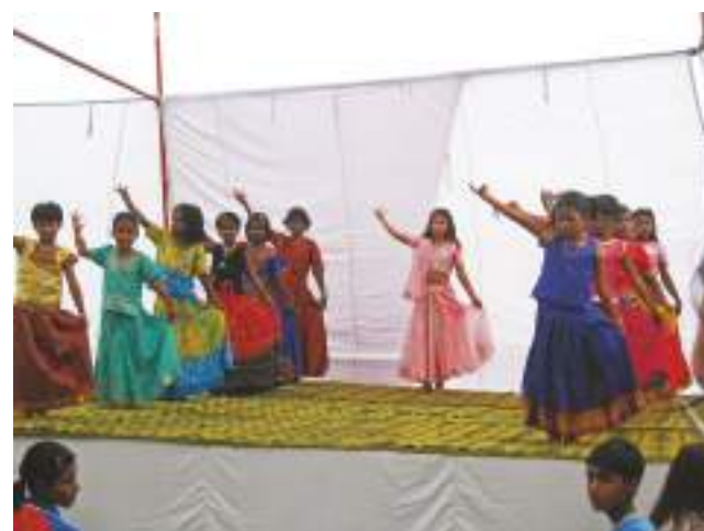
Childrens day celebration at Neev, Mission Education centre, Gurgaon