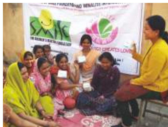
Girls get sanitary napkins for better menstrual hygiene