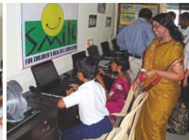
Children learning computers in Pune

Smile Foundation believes that whether you are addressing problems related to healthcare, poverty, population control, unemployment or human rights, there is no better place to start than in the corridors of education. That is because education is the means as well as the end to a better life. While it empowers an individual to earn his/her livelihood, it also increases one's awareness on a range of issues, thus in the process making the individual evolve as a better citizen.