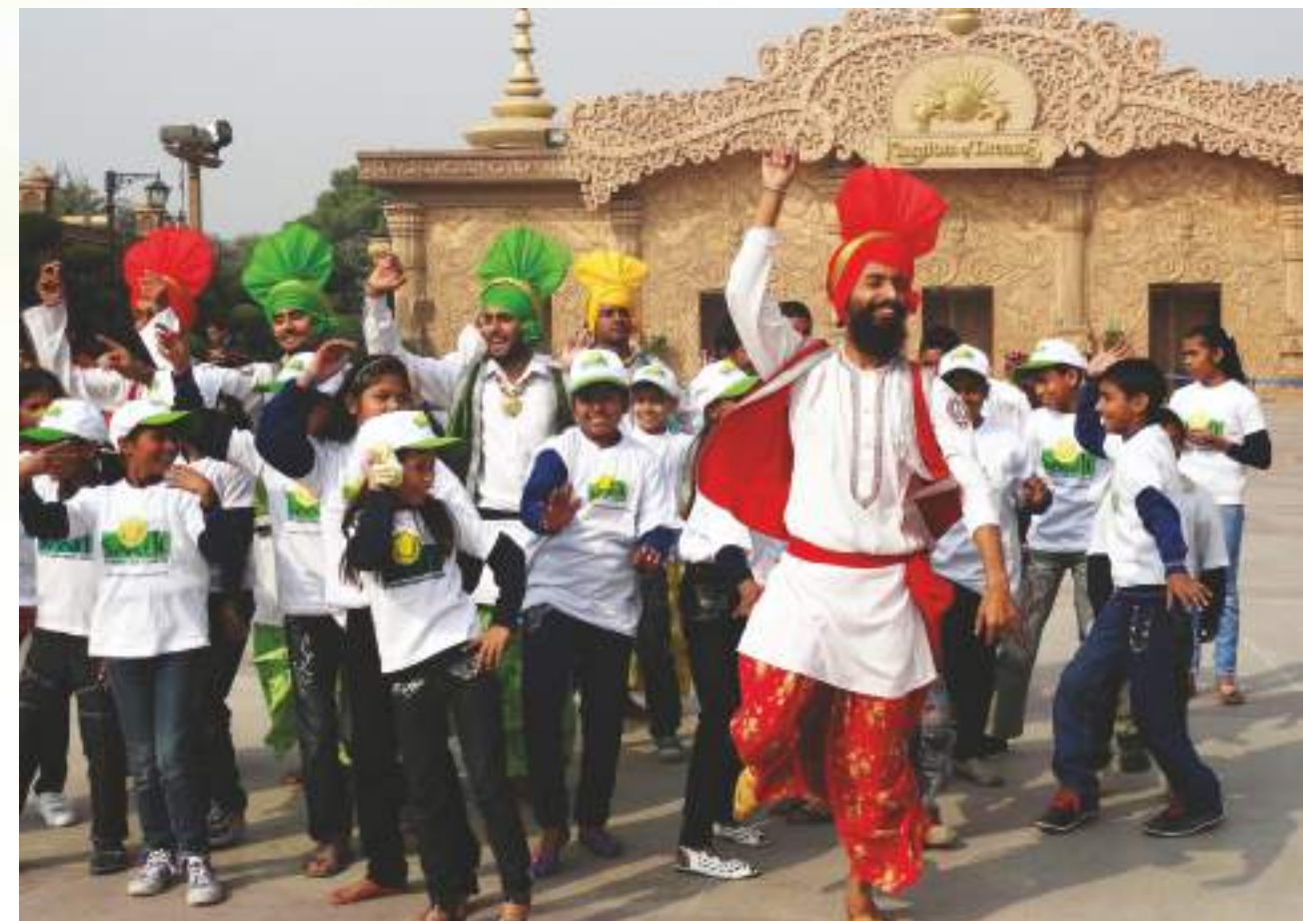
Christmas at Kingdom of Dreams

Having reached the tier I and II cities along with the metro cities, Smile Foundation plans to continue reaching maximum number of people and sensitize them.