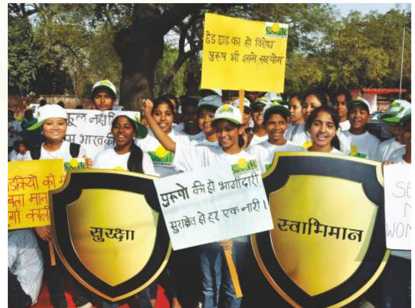
Suraksha and Swabhiman campaign

It is a paradox of modern India that while women wield power and hold positions at the topmost levels, large sections of the women are still among the most underprivileged, abused and exploited. While the role of women is indubitably crucial in sustainable social development, especially of children; measure and initiatives that have been taken remain inadequate, especially for women coming from the marginalized sections. Basis this scenario, Smile Foundation, initiated Swabhiman – a programme focused on empowering underprivileged women and girls. Swabhiman works with a health and empowerment based approach.