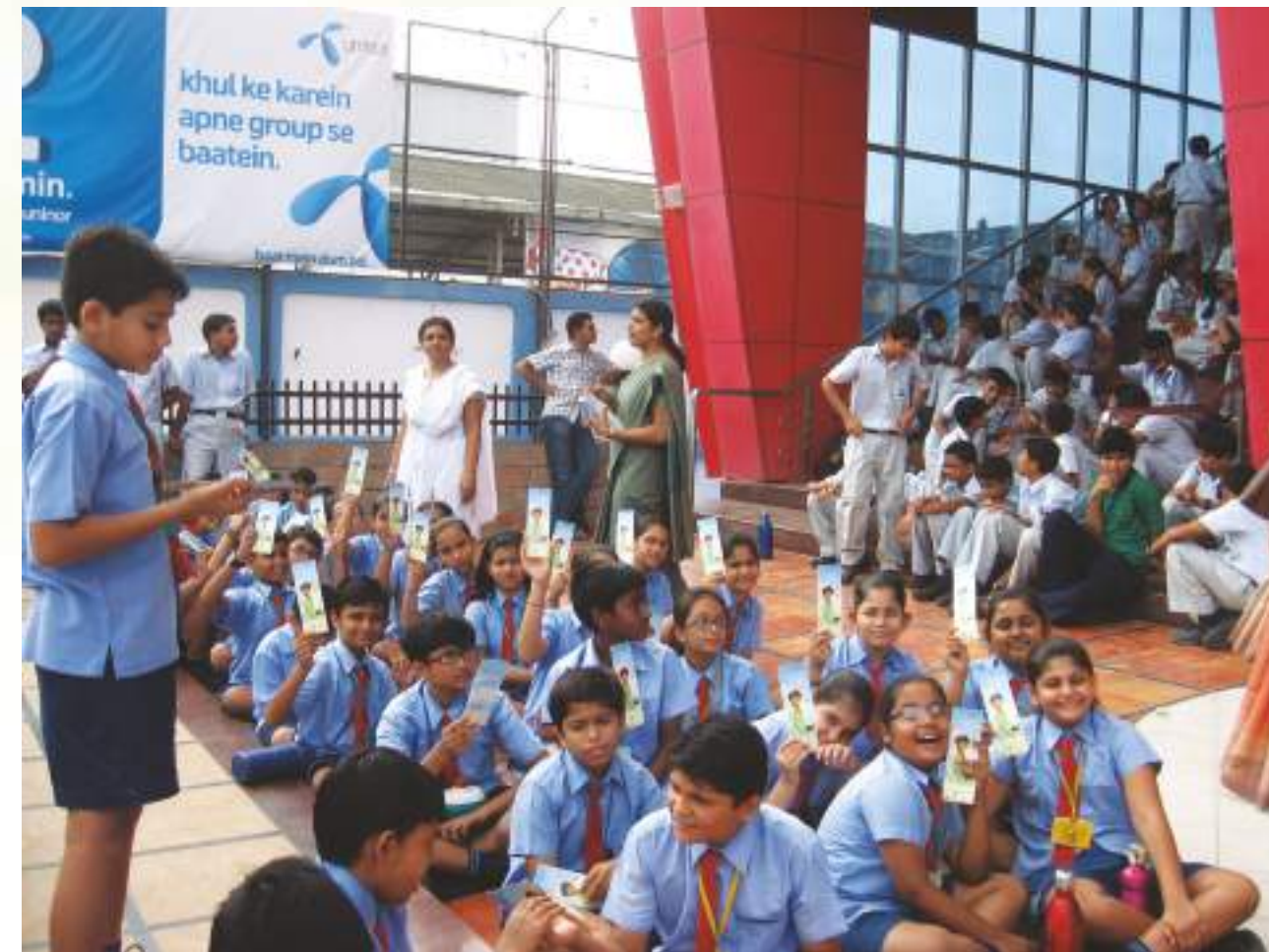
Students of Navrachna International School, Vadodara wait for a special screening of I am Kalam

This year the programme reached over 850 schools sensitizing more than 760,000 children.