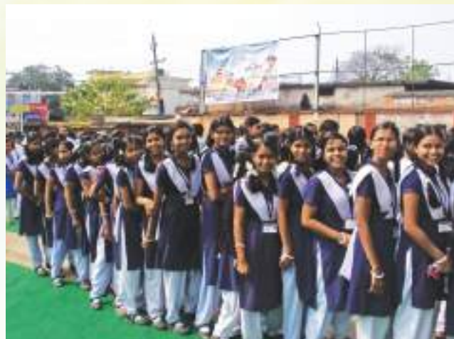
Students queued up for the screening of I am Kalam in Sambalpur Odisha