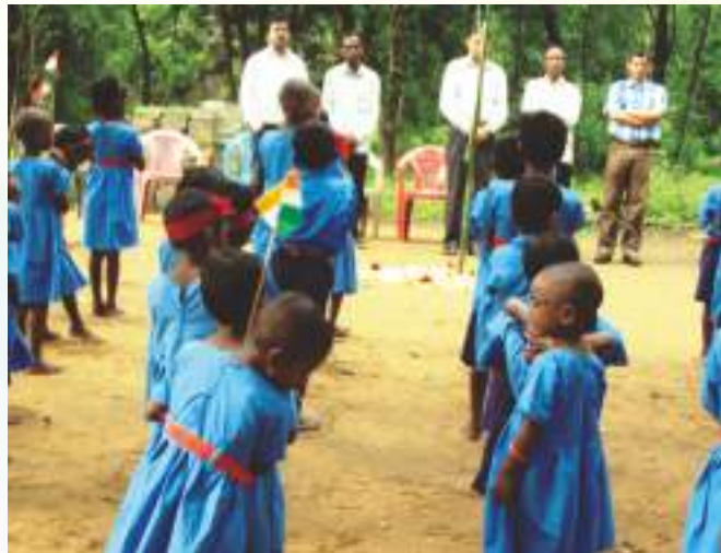
Singing the National Anthem at Jajpur, Odisha