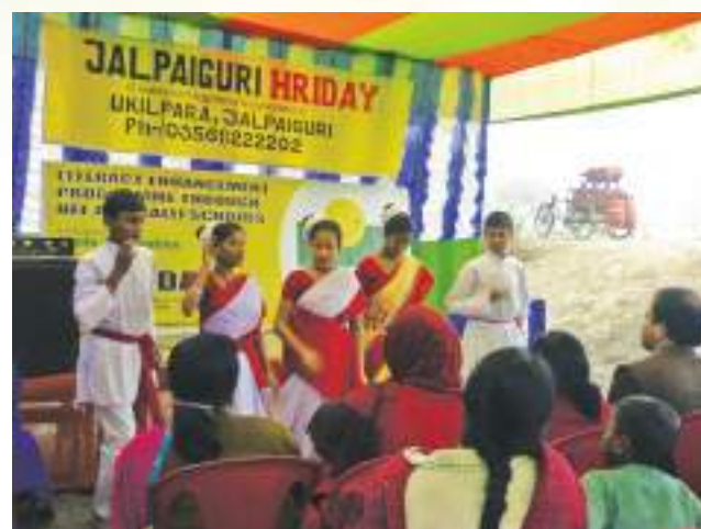
Children performing in cultural programme at Jalpaiguri Hriday Mission Education centre in Ukilpara, Jalapaiguri