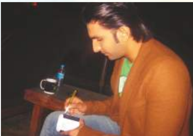
Ranveer Singh pledging his support