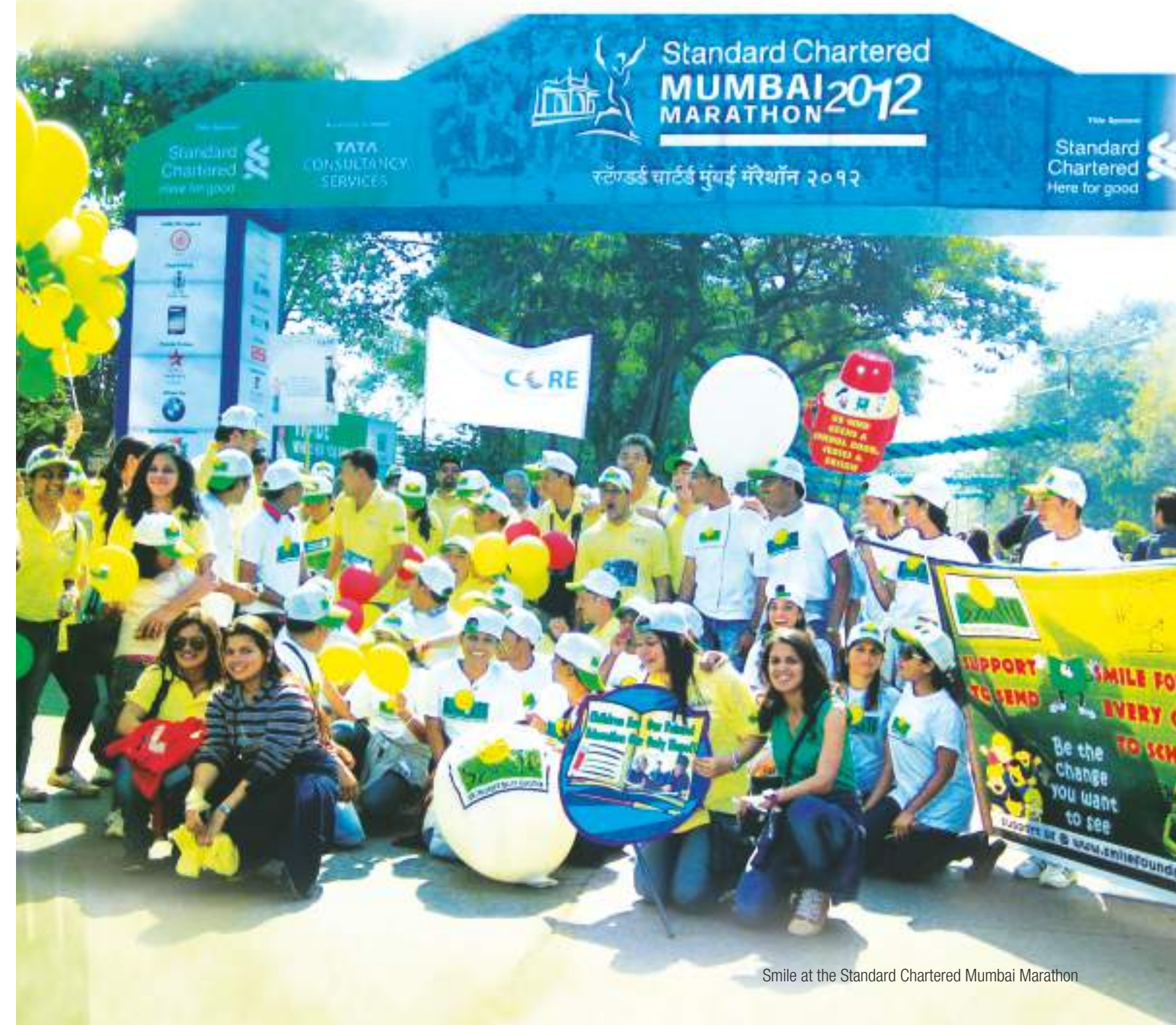
Smile at the Standard Chartered Mumbai Marathon