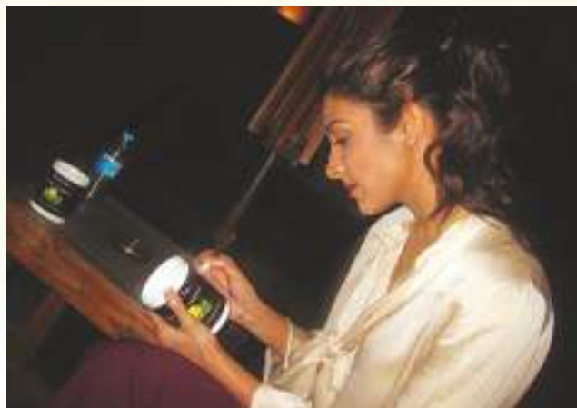
Anushka Sharma pledges to support the cause of children education