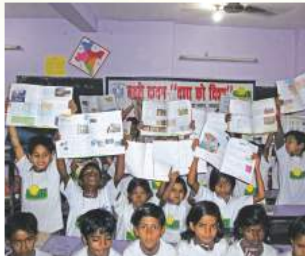
Books are my best friends say children in a Lucknow project

Smile also supports individual children based on their immediate needs. During the last year, over 400 children have been provided special support.