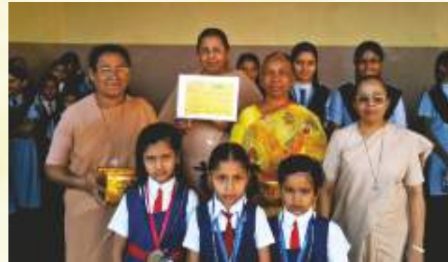
Prize Distribution at Holy Cross Higher Secondary School, Chattisgarh