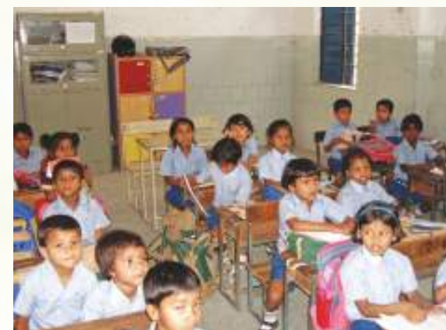
Looking forward - project centre in Delhi

29,278 Children Directly Benefitted Through Various Educational Initiatives