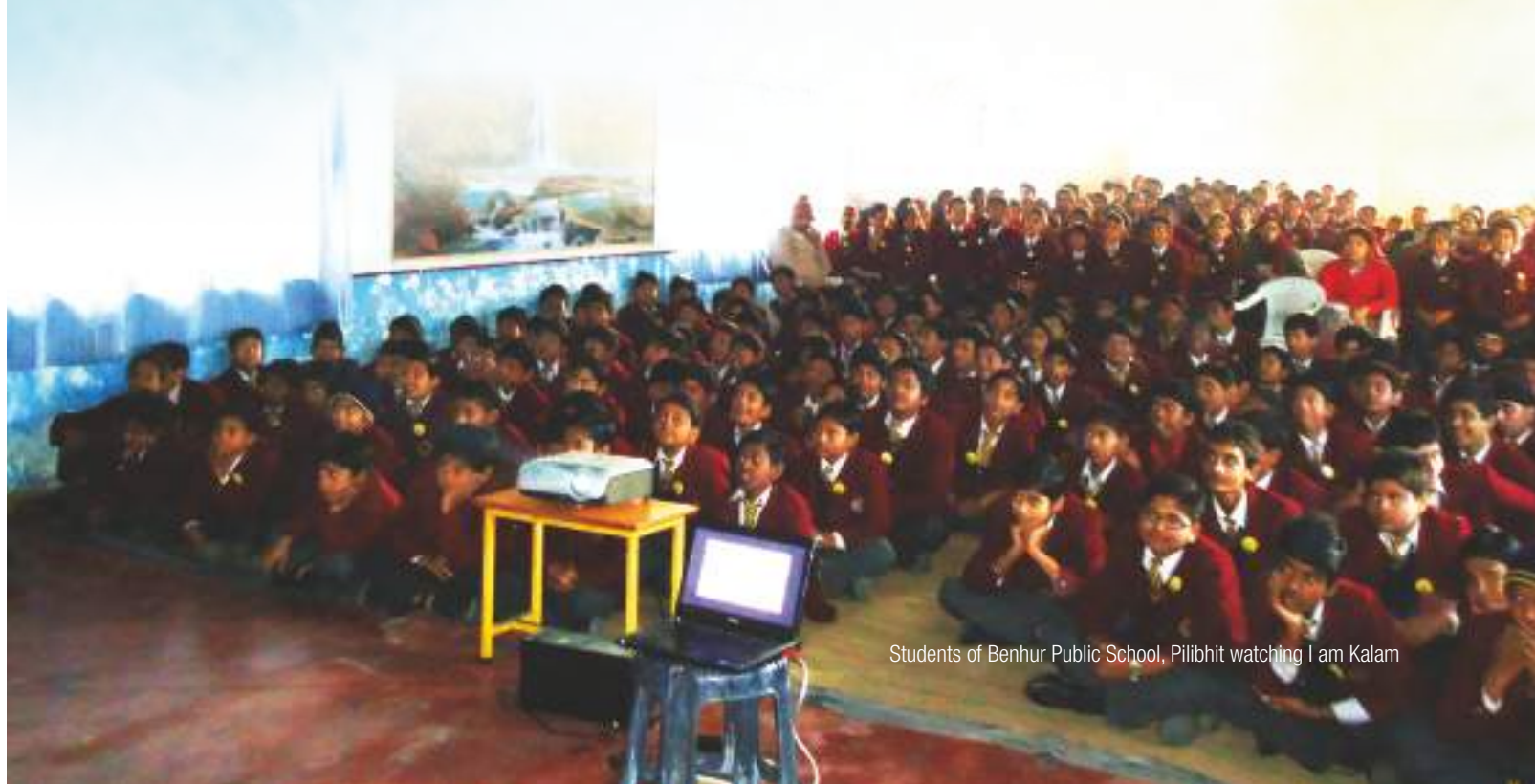
Students of Benhur Public School, Pilibhit watching I am Kalam