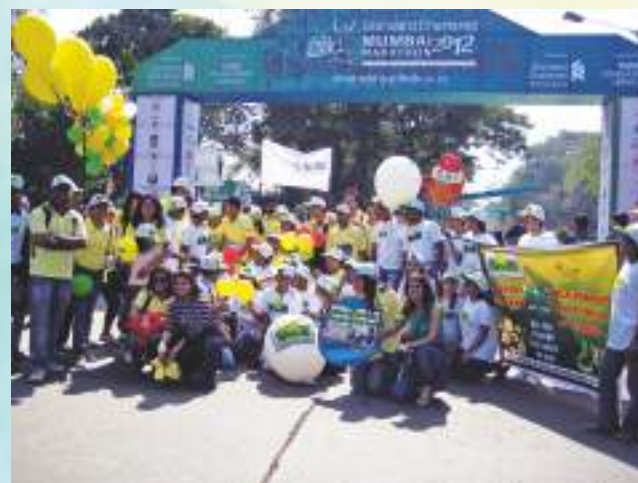
Smile at the Standard Chartered Mumbai Marathon