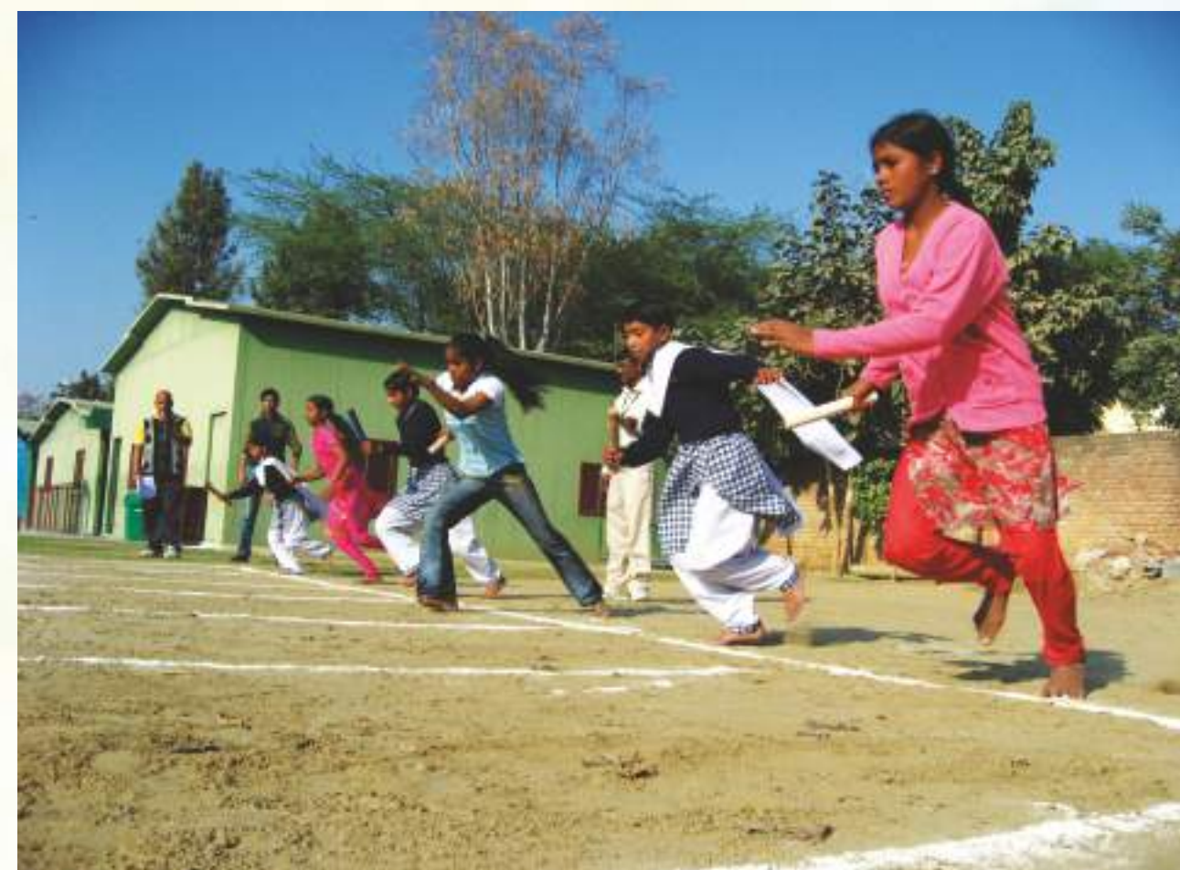
Students during the annual sports day at Orysed, Odisha

Action for Children (AFC) programme is an innovative programme which focuses on long term sustainability of welfare projects and the organisation as a whole. Initiated in 2006-07, AFC programme has come a long way. With every passing year the AFC programme has strengthened Smile Foundation towards delivering effective results at the grassroots and also enhanced the capability of the organisation in trying to achieve sustainability involving local community, privilege section of the society and corporate.