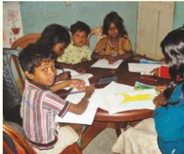
Students of a project in Patna pour their thoughts in colour