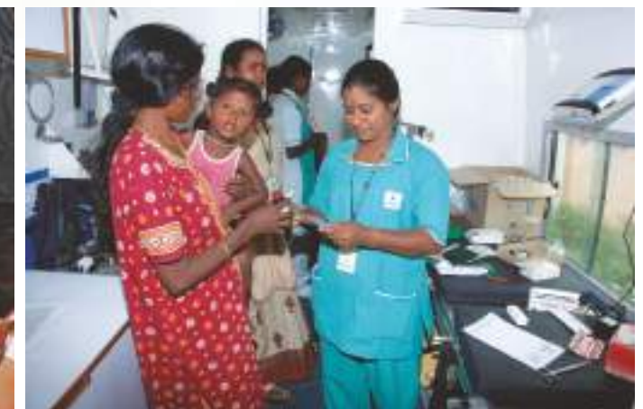
A mother receives medicine for her daughter in Chennai