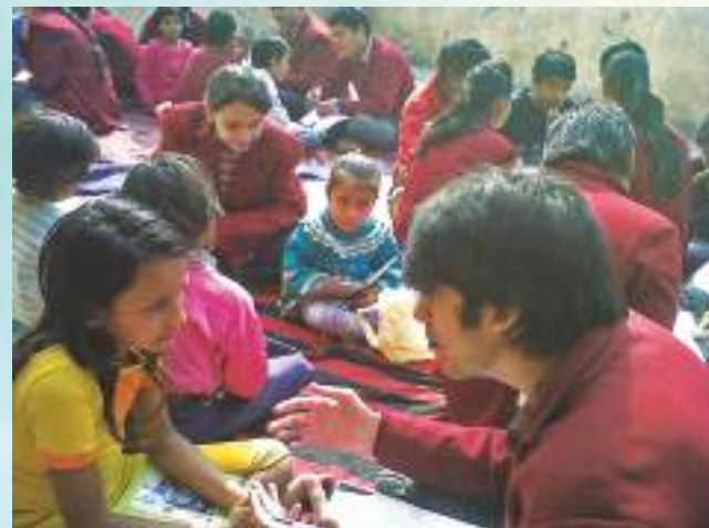
Students of DAV Vasant Kunj, New Delhi interact with Smile beneficiaries