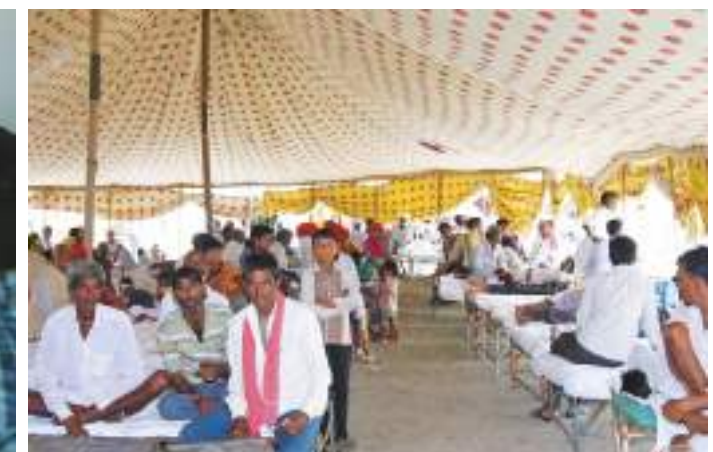
Mega health camp in Bhilwara, Rajasthan

age group of 6-16 years. This project targets a population of 7,500 in five villages and has over 300 direct beneficiaries. The projects in Tamil Nadu and Maharashtra are focused on developing infrastructure in government schools, in order to facilitate better educational performance. The necessary infrastructural support includes building classrooms, separate toilets for girls, school compound walls, supply of safe drinking water and electricity, furniture, computers, lab equipments, etc. These two projects together benefitted over 15,000 children.