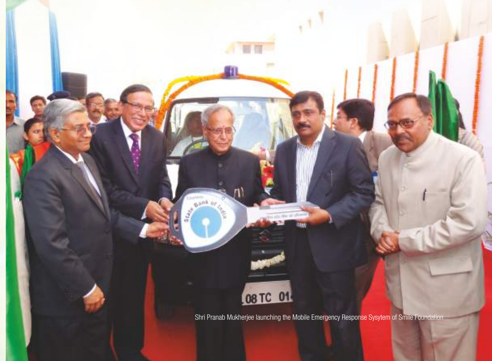
Shri Pranab Mukherjee launching the Mobile Emergency Response System of Smile Foundation

In addition, eminent people like Indian President Shri Pranab Mukherjee, former Indian President Dr. APJ Abdul Kalam, Smt. Sheila Dikshit and Shri Lal Krishna Advani also got associated.