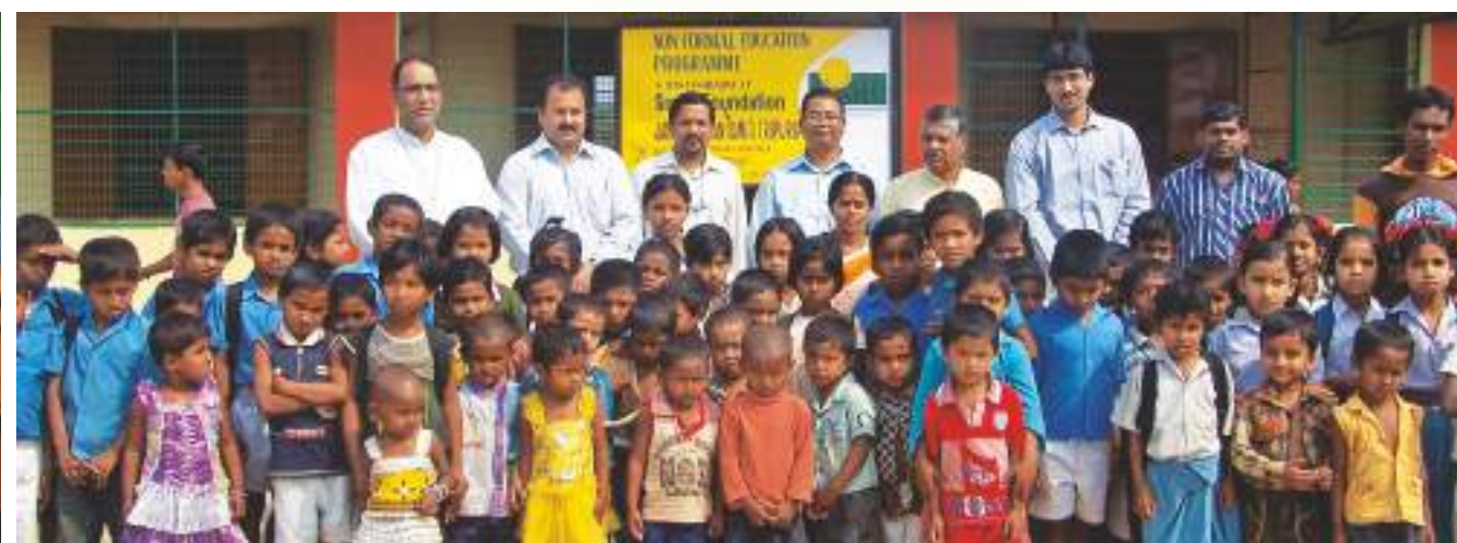
New Mission Education project centre in Agartala, Tripura