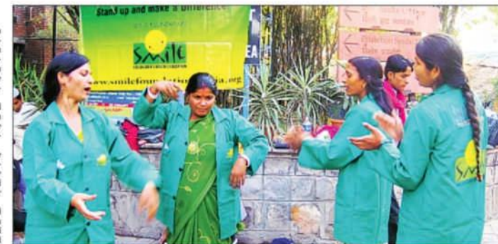
■ The group has girls from slums across the city. They conduct streetplays with messages to raise social awareness among the masses.

The girls hail from 10 slums, including New Ashok Nagar, Shashi Garden (Mayur Vihar), Nat Colony and Ambedkar Colony in Chhatarpur; Kumhar Basti, Harijan Basti, Gali no. 1 to 4 in Neb Sarai, Indira Camp,